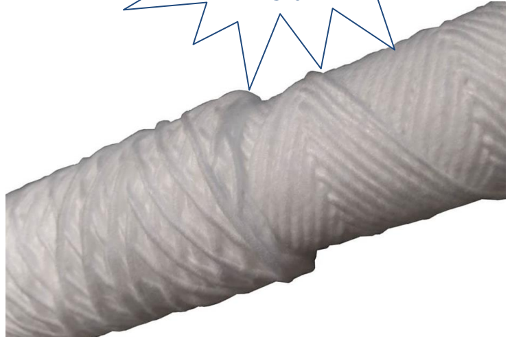
HC Series string wound filter cartridges provide longer life by virtue of their dual-zone construction.

Delta Pure HC “high capacity” series string wound filter cartridges provide excellent filtration for fluids with a wide particle size distribution. The HC series filters are wound with two zones in order to provide longer filter life with challenging fluids. A more open pre-filtration section serves to protect the downstream section and remove larger particles, while a tighter final filter section provides removal of smaller particulates. The rating of each zone is specified in order to provide a filter uniquely tailored to process requirements. Delta Pure offers these depth filters with a choice of filtration media, support cores, and materials to ensure process compatibility. Precision winding geometry provides consistent removal-efficiency. Ratings are available from 0.5µm to 200 µm. Optional core covers allow added contaminant removal assurance. Cartridges are available in continuous lengths from 4” to 72” and diameters to 4 ½”. End fitting options allow installation into most filter housings.